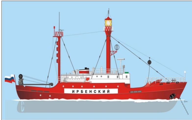
Fig. 4. Lightship Irbienskij – reconstruction