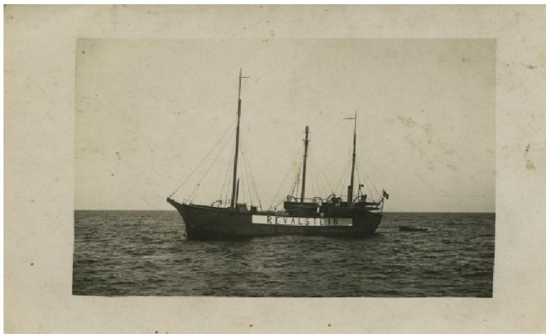
Fig. 5. Lightship Revalstein (Tallinnamadall)

At the entrance to the port of Tallinn (Revel), about nineteen sea miles due North West away from it, near a rocky shoal area called Revalstein, a wooden lightship Revalstein 8 was designated to serve in 1858. It wasn't the best choice, so in 1864 the ship was replaced by a vessel of the same name, but based on metal fuselage. During the day, two spheres painted in vertical black and white stripes were hung on the ship's two masts. At night, light systems made of Arganda lamps and, later on, eight oil lamps with catadioptric lenses were hung. In 1898, the systems were replaced by newer ones, with Frensel 6-class lenses. In order to mark the lightship better at night, a lamp was also hung on the vessel's stay.