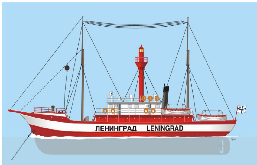
Fig. 1. Lightship Leningrad – reconstruction

Source: RGAVMF F 404. Op.3, d 1805, L136. Author S. Sierakowski.