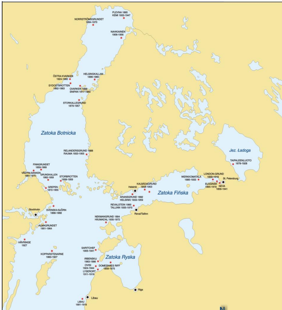
Fig. 3. The Gulf of Bothnia and the Finnish gulfs with the lightships