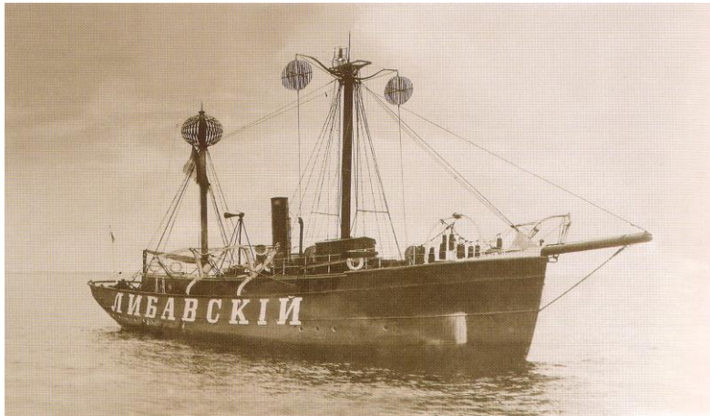
Fig. 6. Lightship Libavskij

Turned into a lightship it kept on being renamed: Relandersgrund , Åransgrund and Helsinki . It served on three different positions between 1918–1959. Later, between 1959–1983 it was being exploited as a supporting vessel named HYÖKY . Bought in 1983 by a private company it remained in Helsinki as a museum ship and a restaurant.