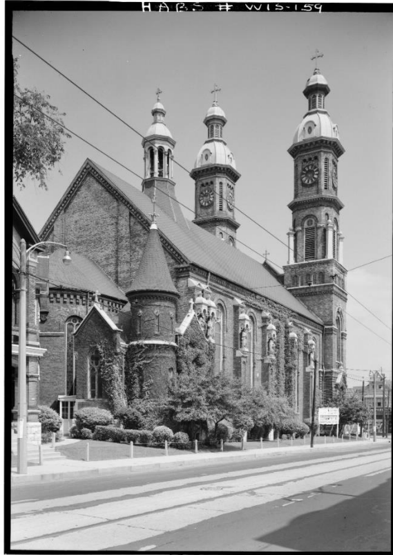
St. Stanislaus Church, Milwaukee Wisconsin

city (Gate of Heaven, St Stanislaus Parish of 100 years, 1866-2016, 2016). Today's church remains a "designated religious community" where worshippers travel many miles to attend services from other areas of the city and region.