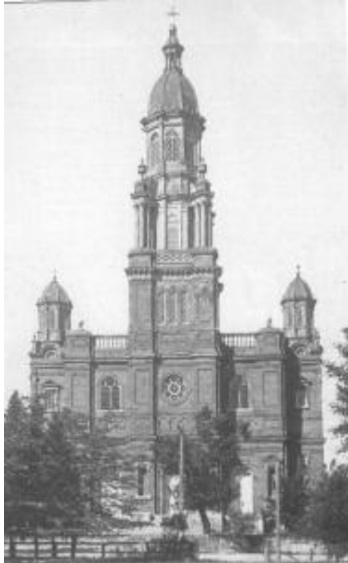
Sacred Heart Church

Stevens Point is the center of Portage County which was only composed of about 1500 residents in 1860. Today the population is about 27,000. The church history of the area was both turbulent and fascinating.