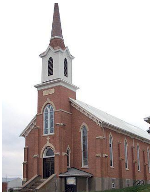
Sacred Heart Church of Pine Creek, Wisconsin